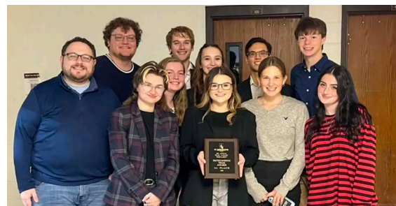
The Mock Trial team ran undefeated at the St. Bonaventure tournament.