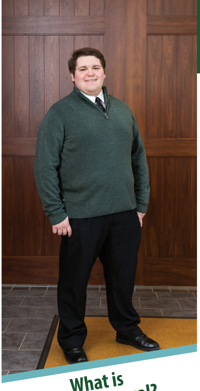
What is business casual?